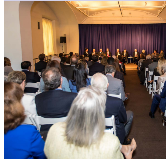
▲ Roundtable of Former SEC Chairs, June 3, 2019

On the afternoon of the anniversary dinner, Chairman Clayton moderated a special program featuring nine former SEC Chairs in a thought-provoking roundtable on a range of topics. He explored how they dealt with unexpected challenges; the best advice that helped in their role as Chair; changes in the markets that impacted their priorities; and their thoughts about areas of the current marketplace which may pose new challenges or risk. The dialogue provided unique insights into the hearts and minds of these former Commission leaders and left the audience with a greater appreciation for the skills each brought to bear during his/her tenure.