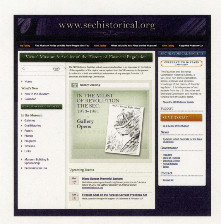
The virtual museum and archive, December 2009.