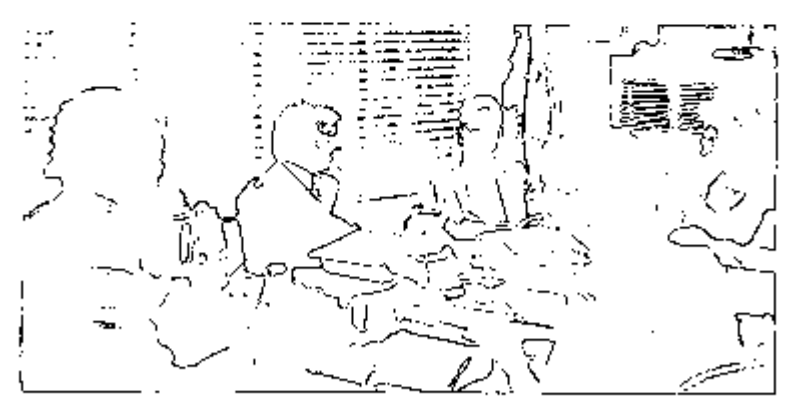
Policies are discussed at frequent meetings. Freedom of expression is one of the great strengths of the Commission.

The SEC created a Directorate of Economic and Policy Research in an effort to integrate better the Commission's economic analysis